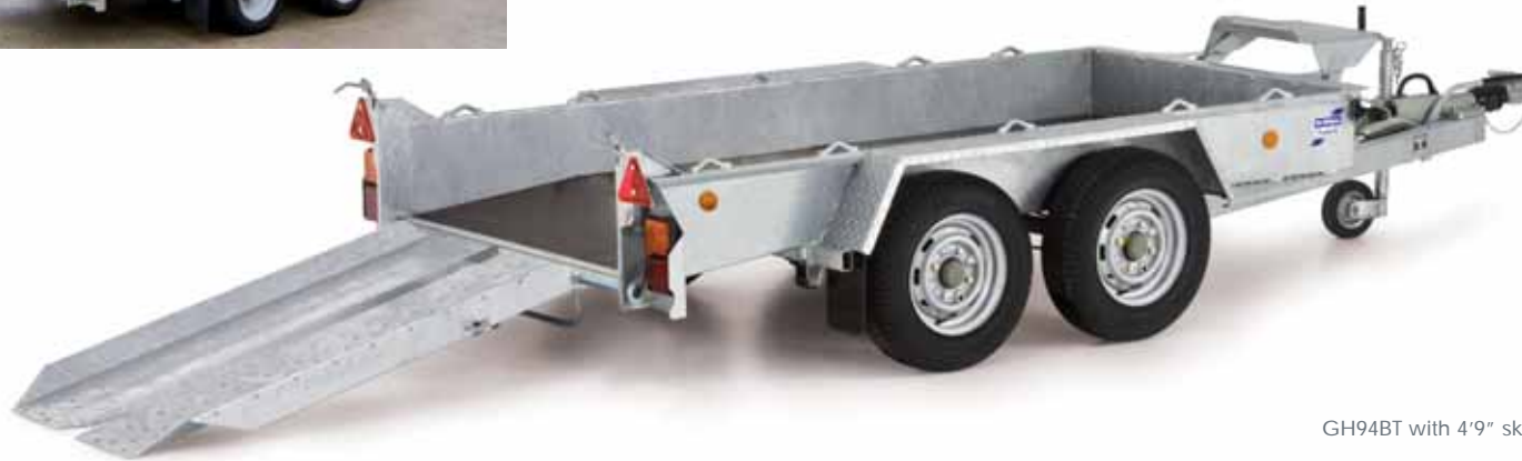
GH94BT with 4'9" skids

Three self-supporting knife-edge options are available on the GH94 and GH1054 models.