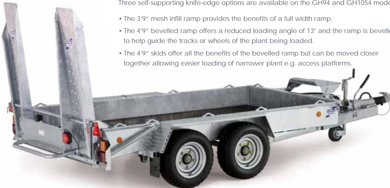
GH1054 with 4'9" bevelled ramp