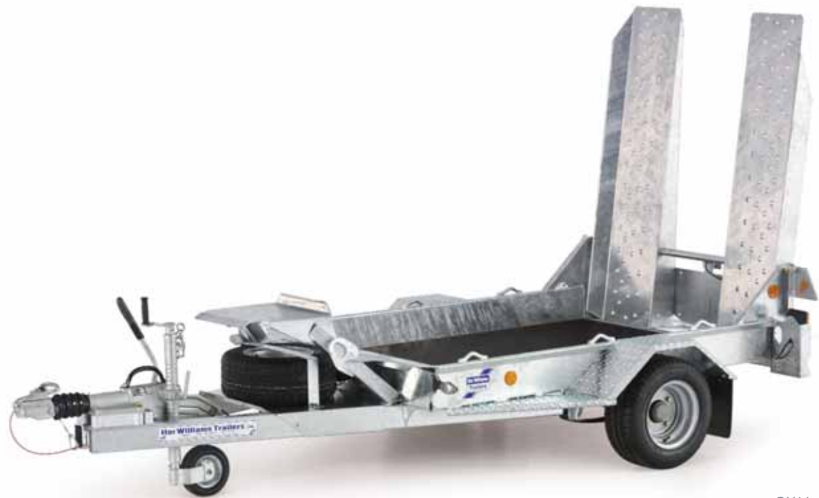
GH64 with 4'9" bevelled ramp

An LED 12/24v option is available on all GH models. This can be a real benefit on hire fleets. However, LED lights draw very little current and this means some vehicles present problems when coupled with LED equipped trailers, including (but not limited to) hazard warning lights flashing continuously and erroneous dashboard tell-tale lights. Where such problems occur, these are vehicle problems and Ifor Williams Trailers will not be responsible for their resolution. Owners are strongly advised to make thorough checks with the vehicle manufacturer before buying an LED equipped trailer.